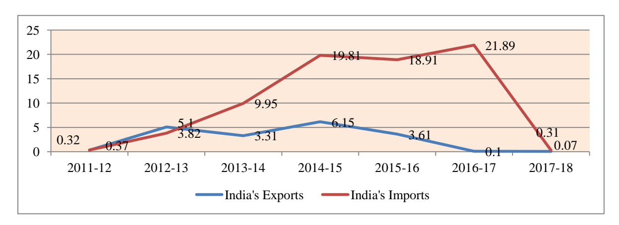
Figure 4: India-Myanmar Border Trade via Moreh and Zokhawthar (US$ million)