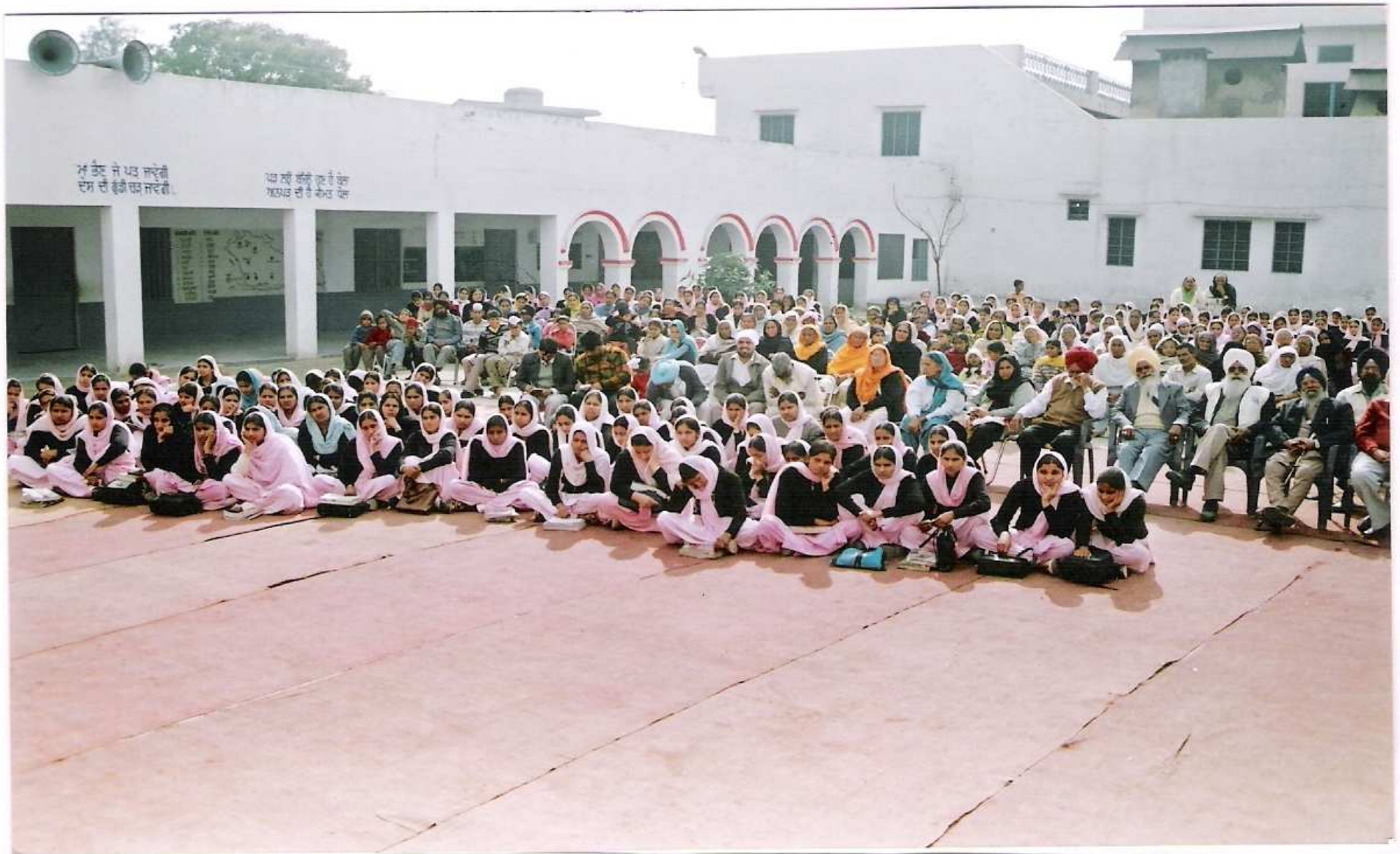
A public gathering and school students at village Urapur. Public meeting was called to campaign against female foeticide.