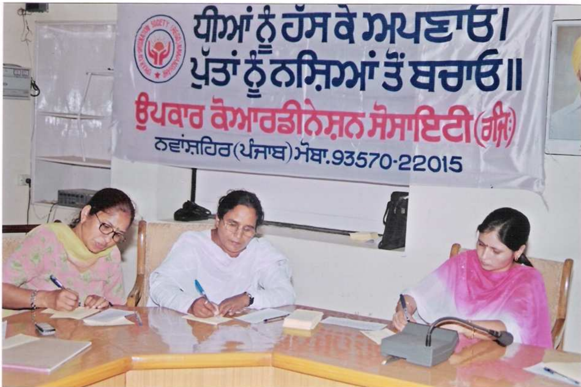
Post cards are being written to girl students, Lady Sarpanches, Lady teachers, wives of Sarpanches for their cooperation to stop Female Foeticide in the Distt.