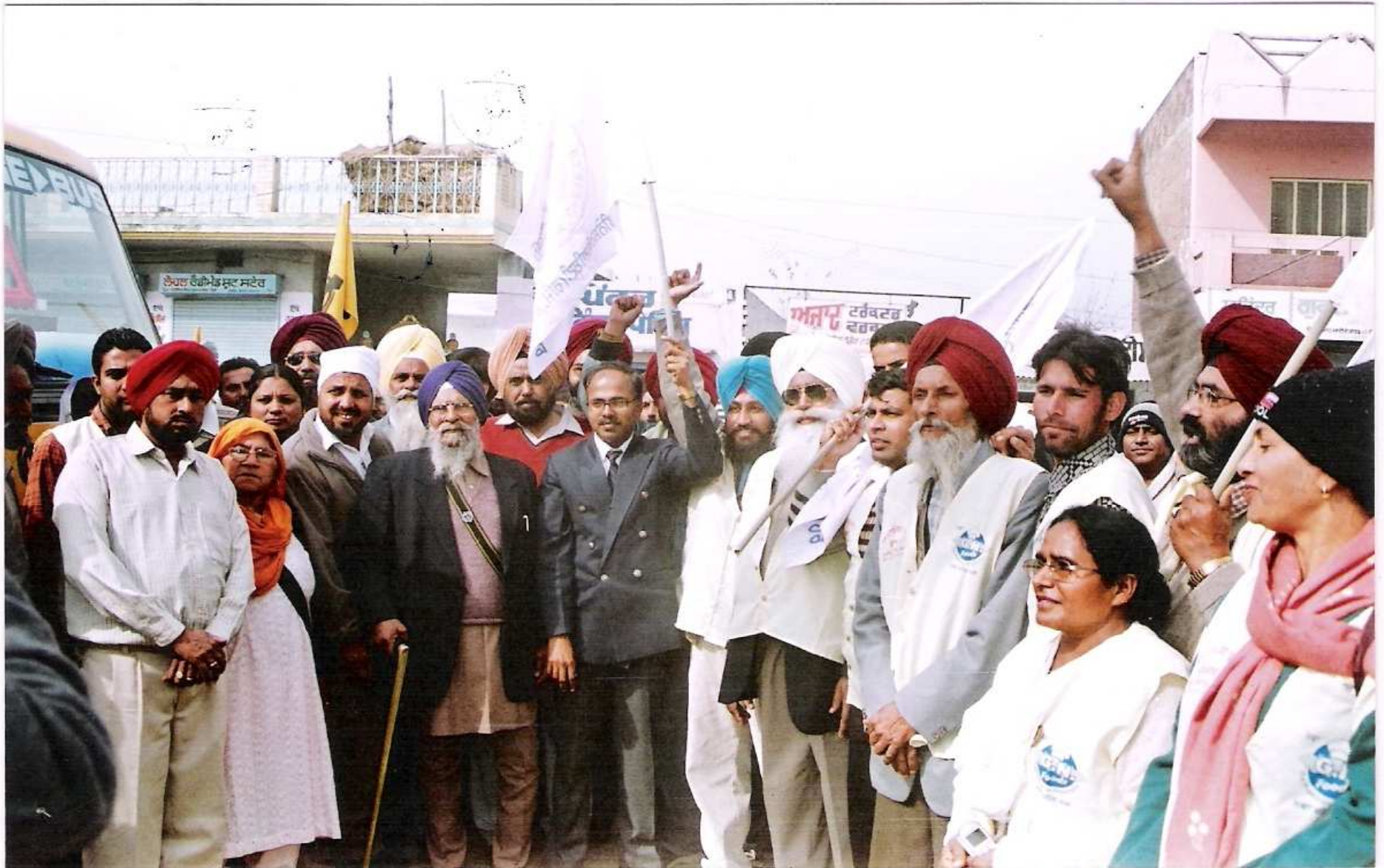
Welcoming the ralliest by the D.C. and other villagers at village Urapur.