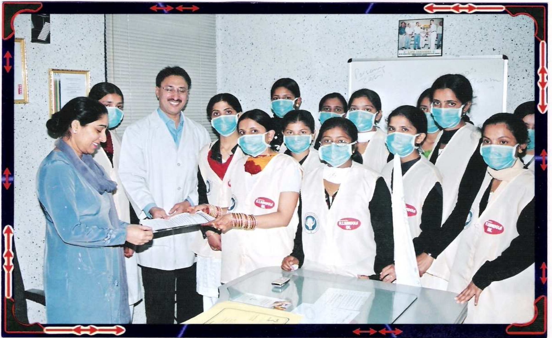
College and school girls presenting a memorandum to private clinics urging to "Save the Girl Child".