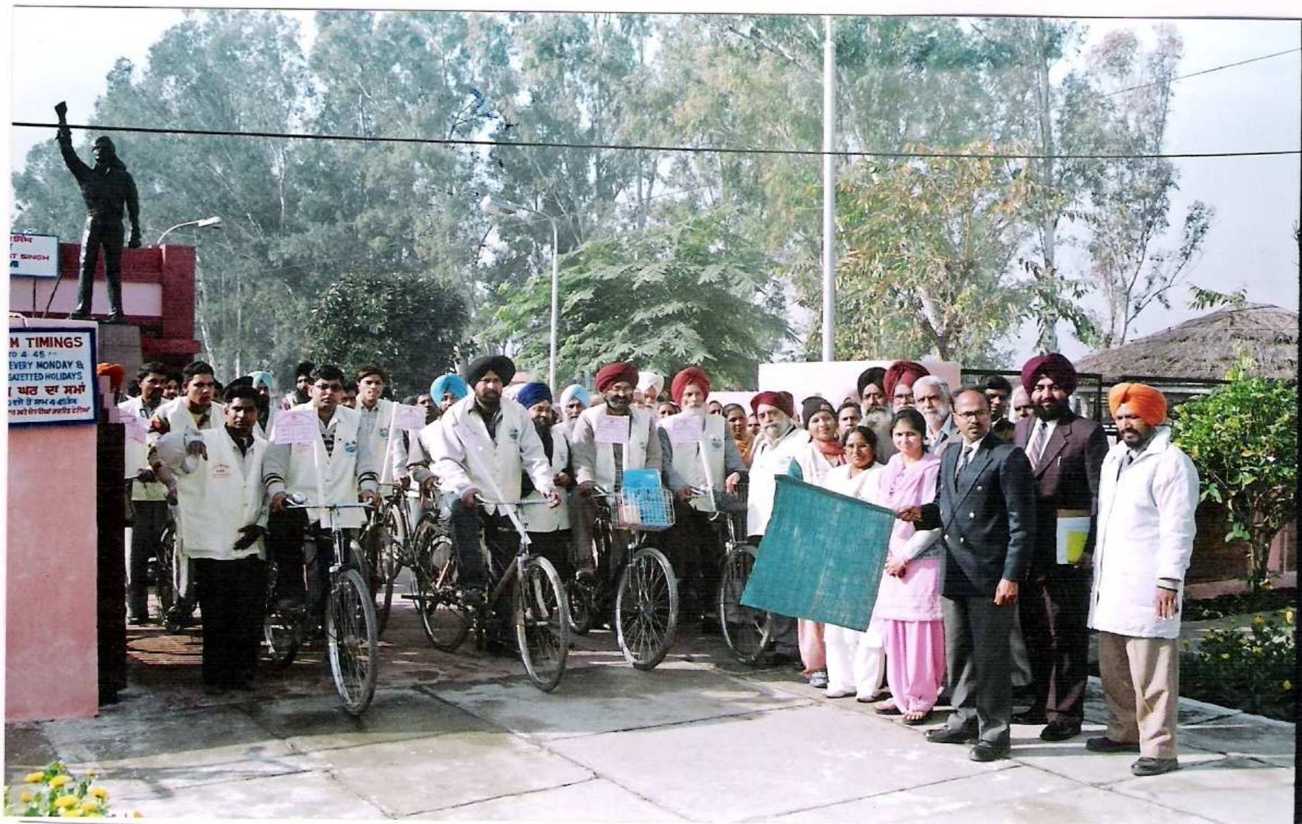
Flagging of cycle rally by D.C. Nawanshahr at village Khatkar Kalan.