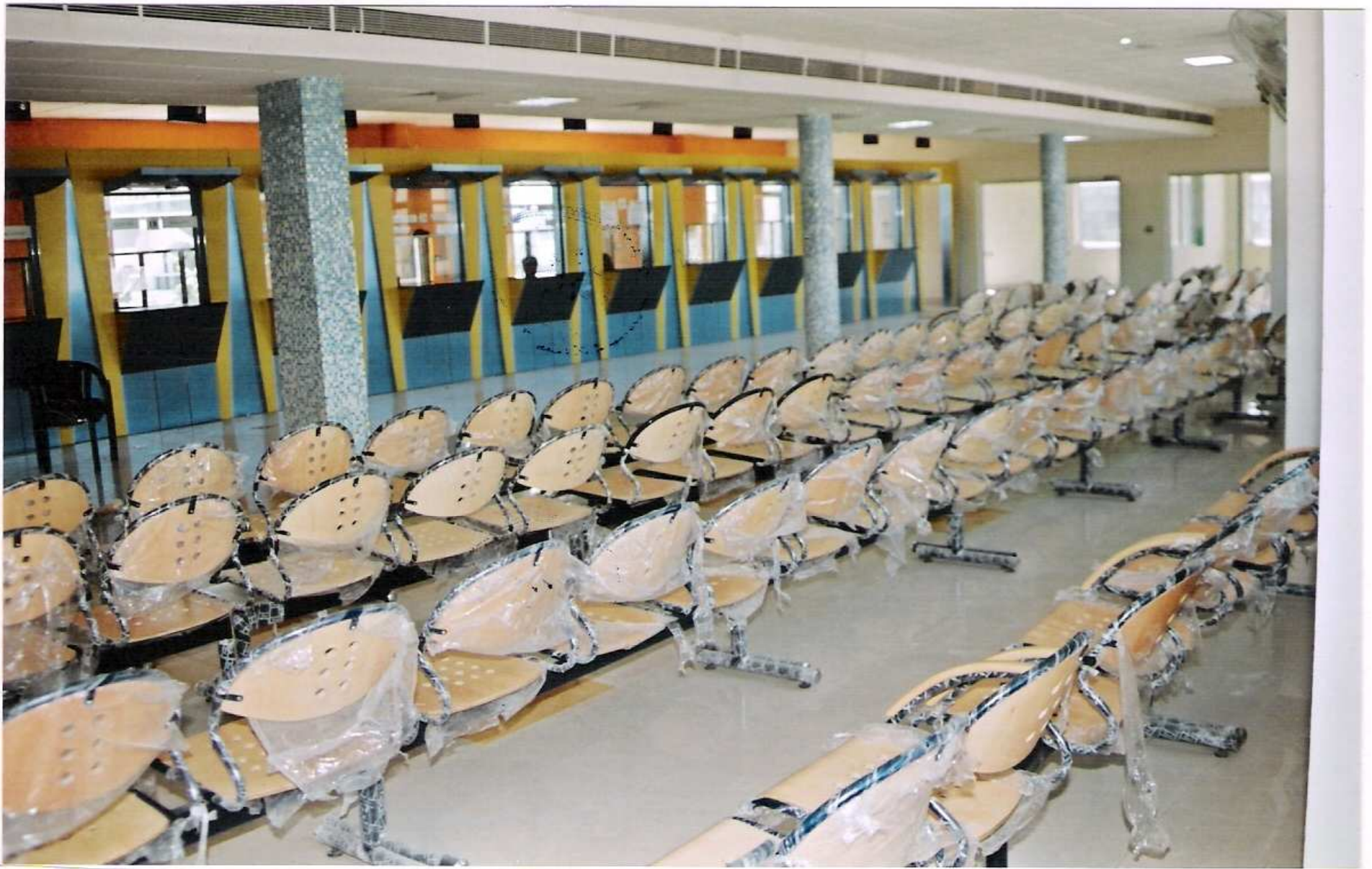
Another view of Suwidha Centre at Nawanshahr- providing adequate space for the public to sit comfortably.