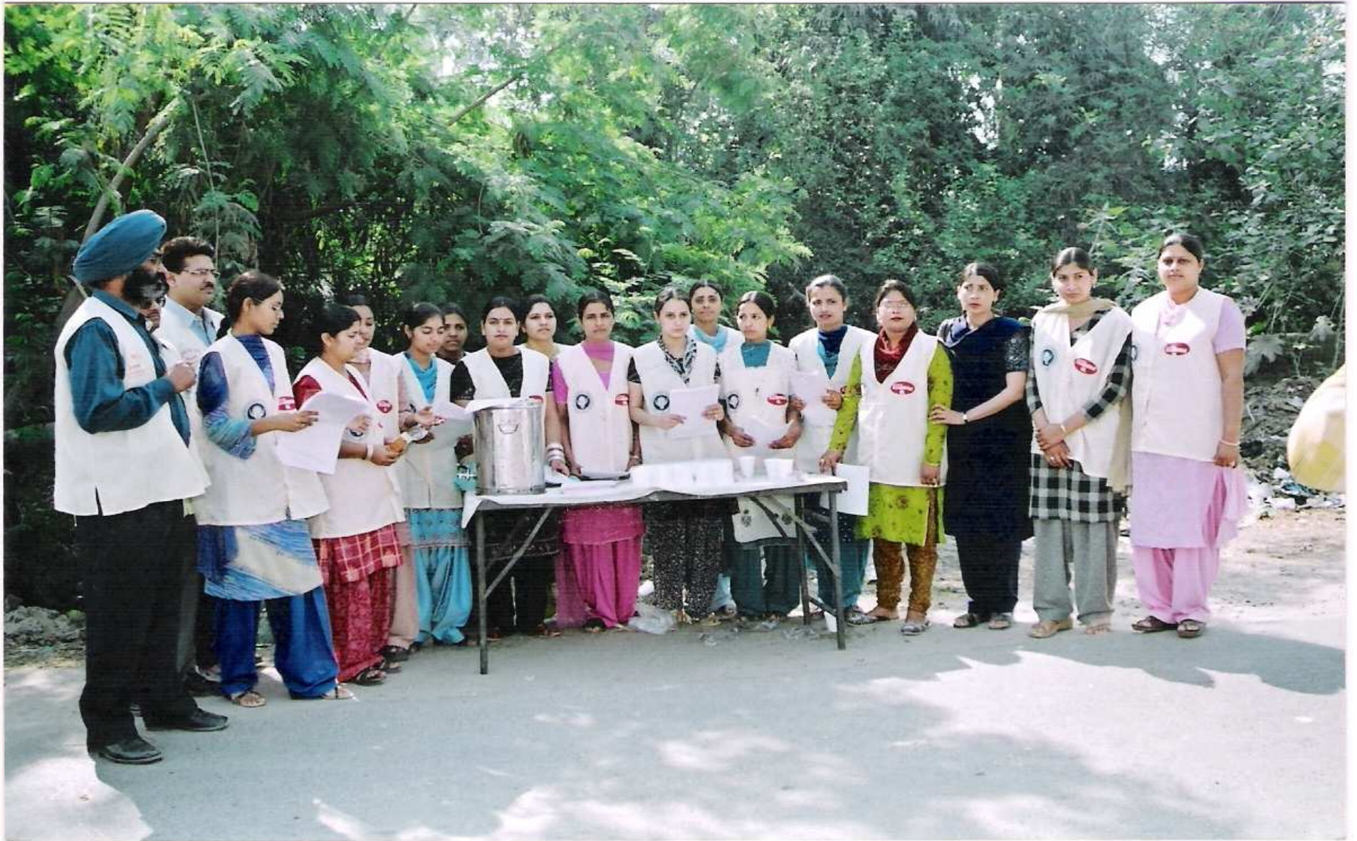
Girls and social workers offering langer and tea to the passers by and urging them to "Save the Girl Child."