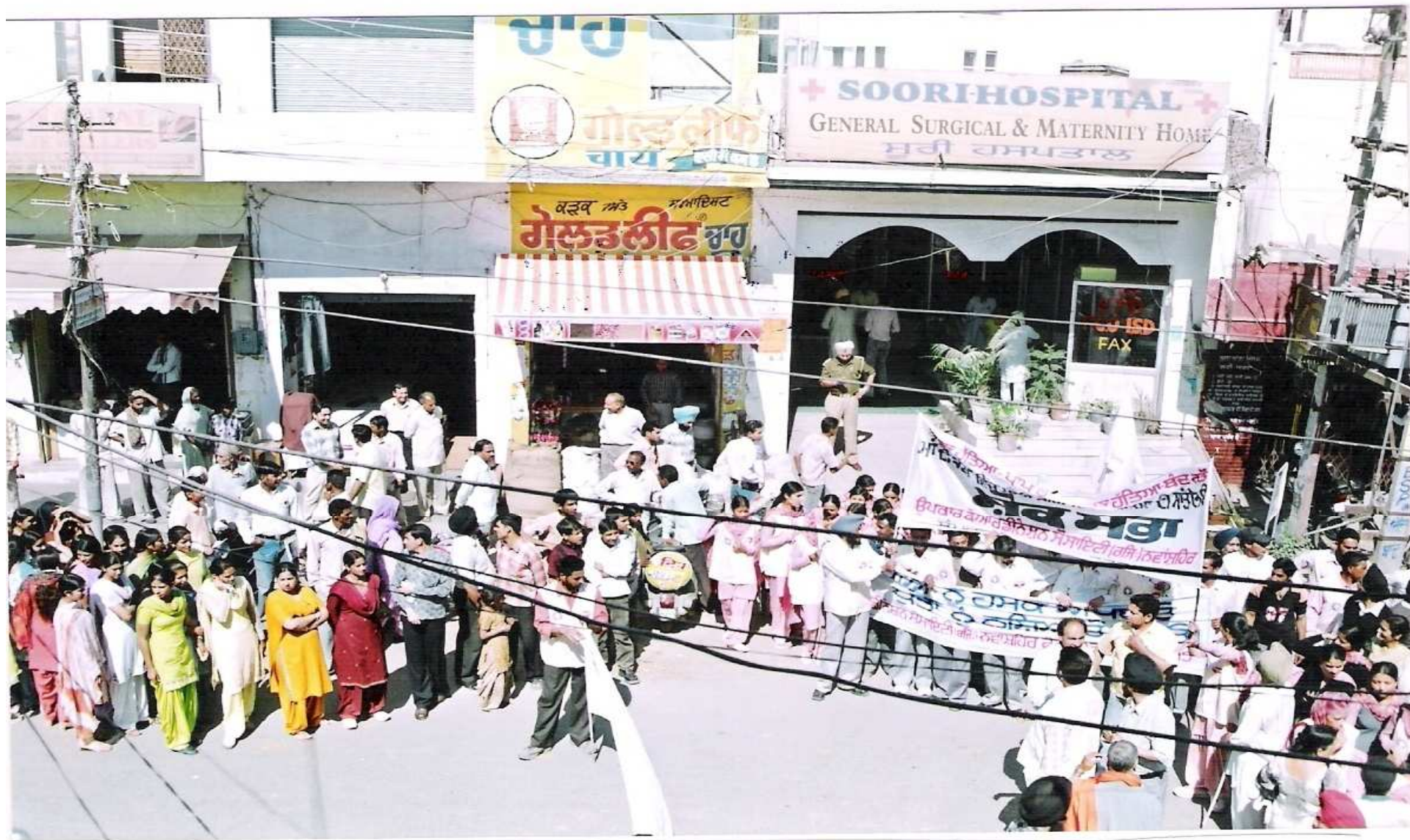
Social workers and public gathering on dharanas against Suri Hospital who indulged in sex determination followed by abortion subsequently .