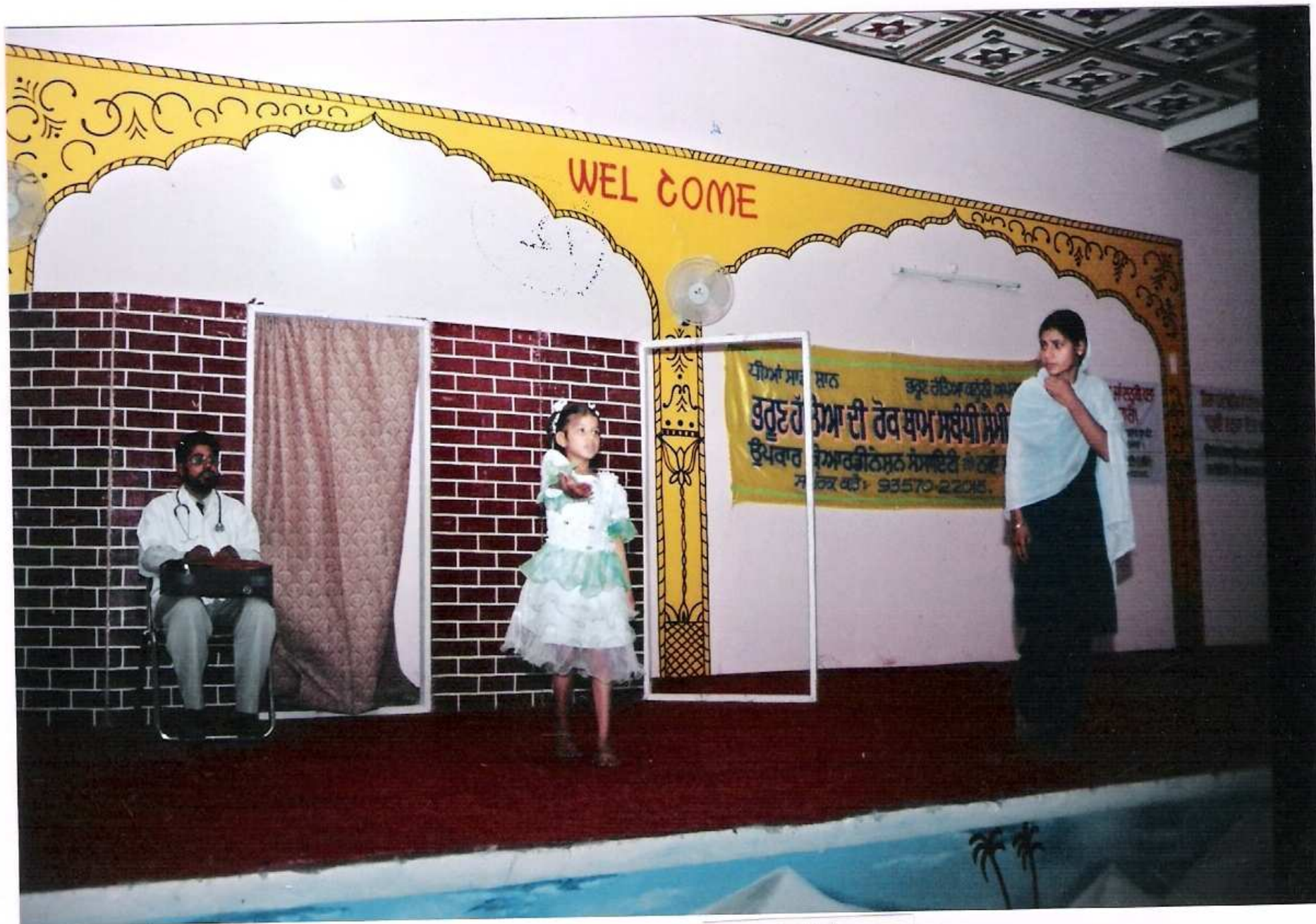
A play on female foeticide.