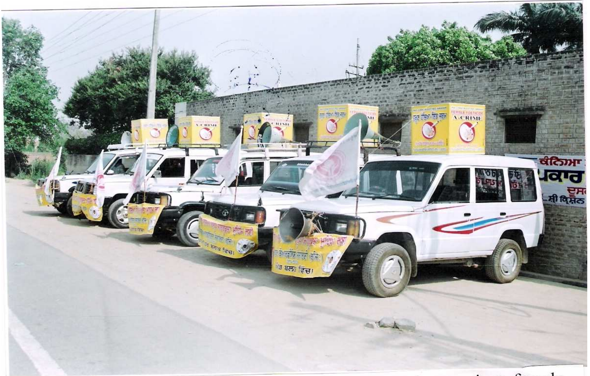
Vehicles hired to launch intensify the campaign against female foeticide , one each for a block.