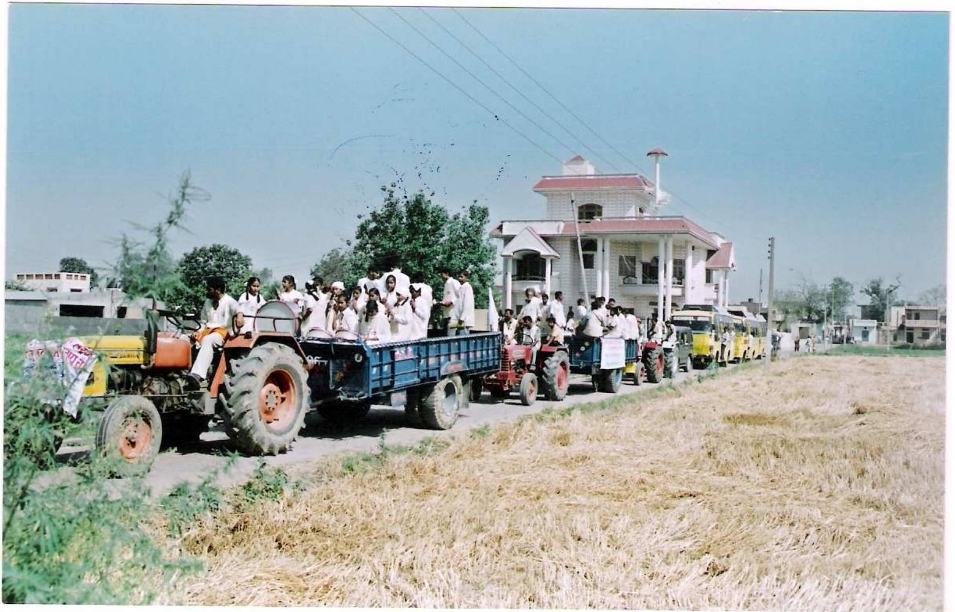
Social workers and villages on tractors, buses and cycles campaigning against female foeticide.