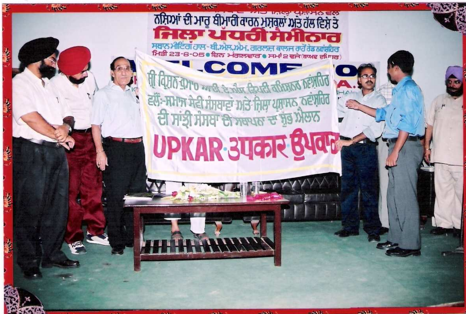
Launching of Upkar Coordination Society.