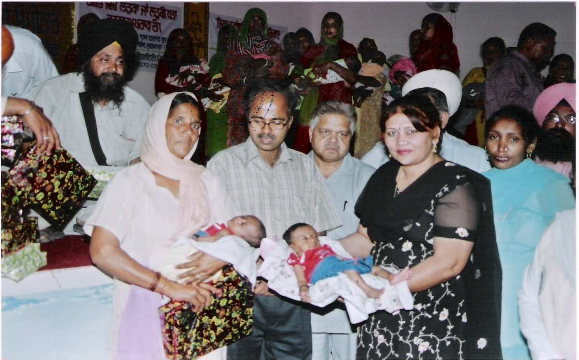
Twin girl children born in the month of January, 2006 and parents and other girl children with D.C.