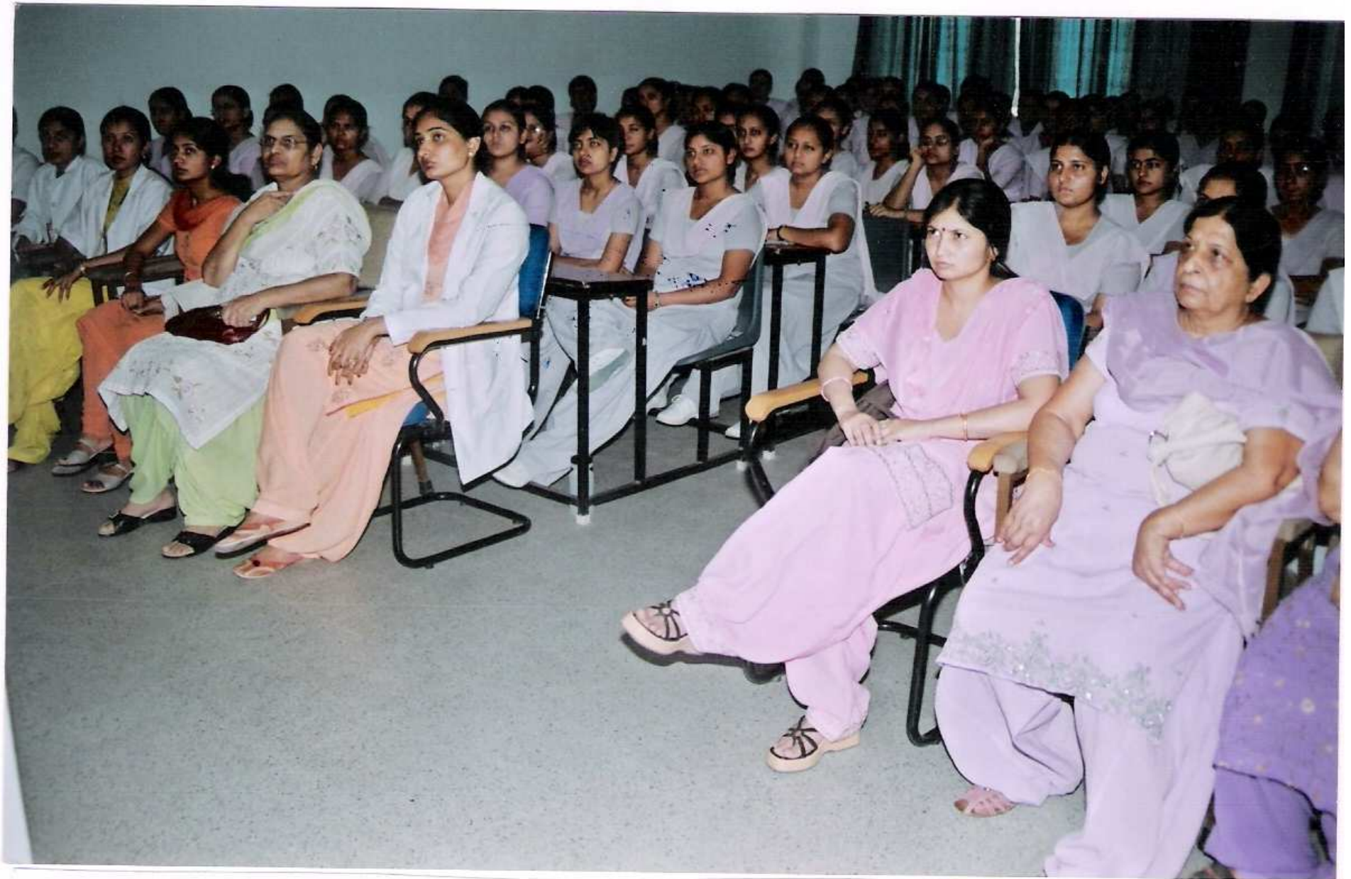
A seminar organized in a Nursing Institute making young students aware about menace of female foeticide.