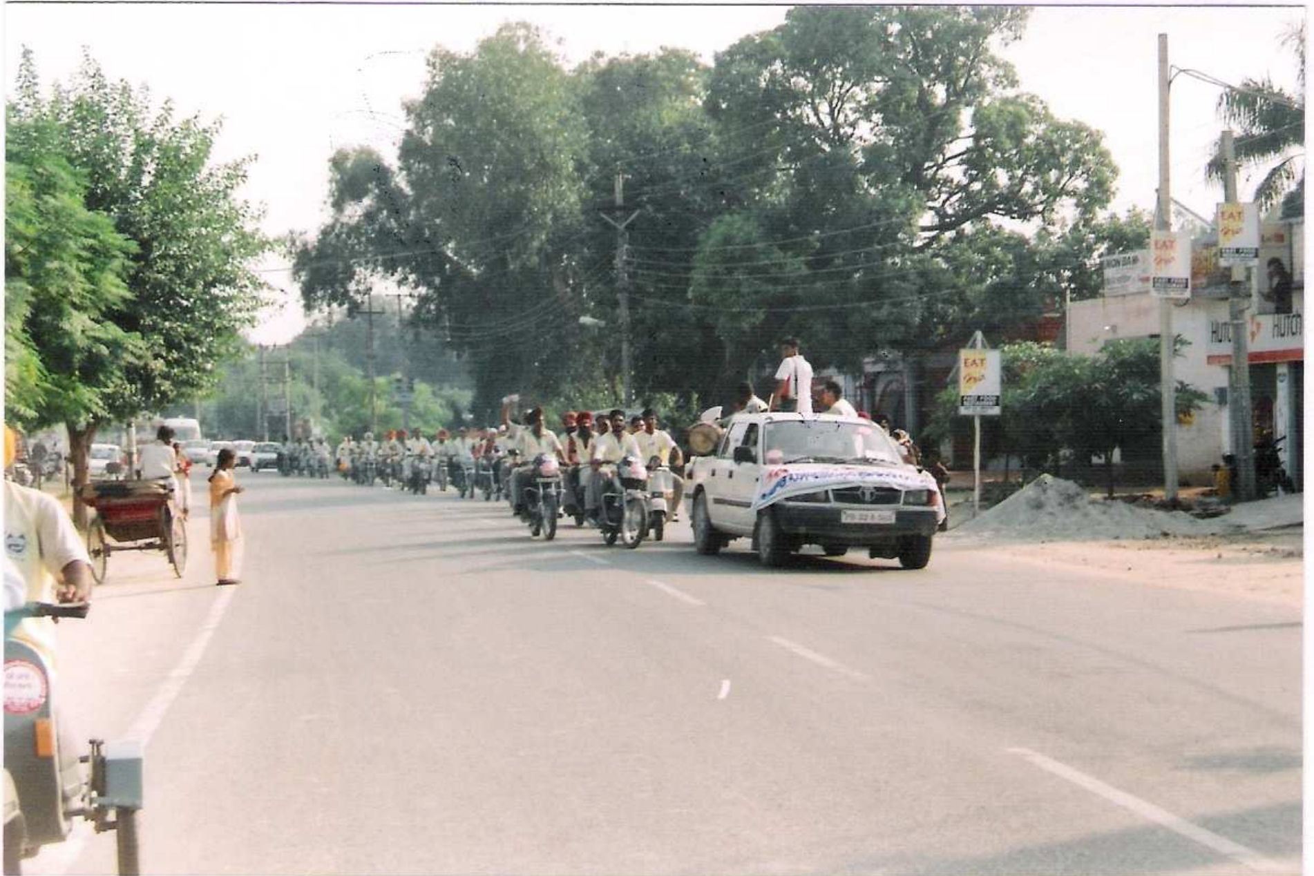
Social workers against female foeticide on scooters and cars .