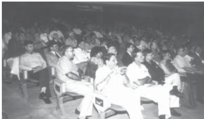
Distinguished audience at the lecture