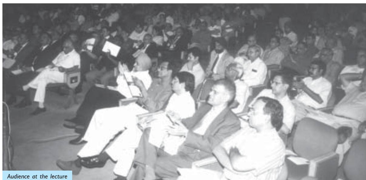
Audience at the lecture