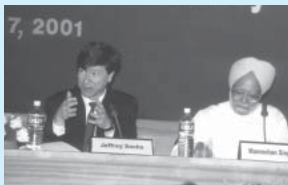
Jeffrey Sachs, Chairman, CMH and Manmohan Singh, former Finance Minister of India