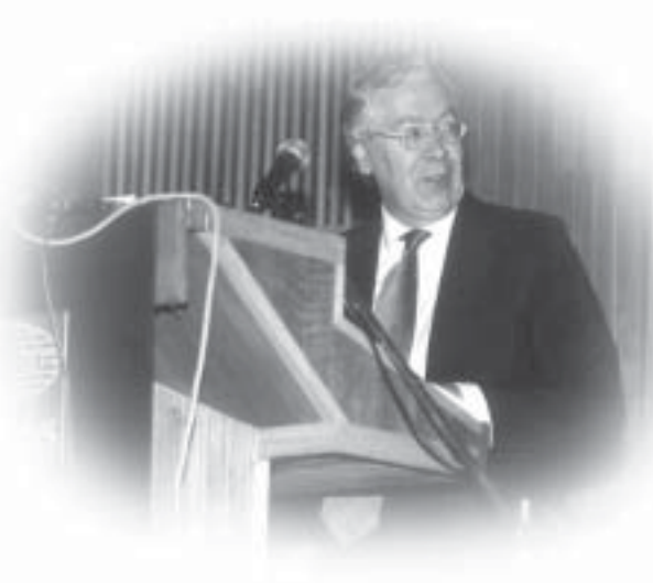
Mervyn King delivering the First K B Lall Lecture on "The International Financial System: A New Partnership"

Dr King maintained that progress can only be made by closer cooperation between the developed and developing countries. The development of standards and codes, the design of IMF lending and the wider agenda of trade liberalisation and international cooperation are all part of the new partnership. Crisis prevention should be at the heart of the policies of both emerging markets and the international financial institutions. It is useful to distinguish between measures to improve economic performance and prevent financial crises, on the one hand, and ways to resolve crises once they have occurred, on the other. He also emphasised that the closeness of the relationship between Britain and India is a compelling reason for their working together in the various international fora to improve the international financial system (also see p. 11).