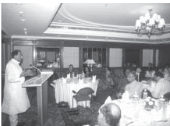
C P Thakur, Health Minister, Government of India, addressing the distinguished audience during the dinner session