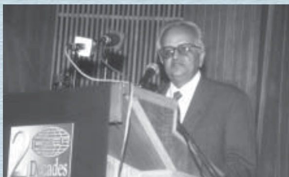
Bimal Jalan, Governor, Reserve Bank of India, who chaired the lecture