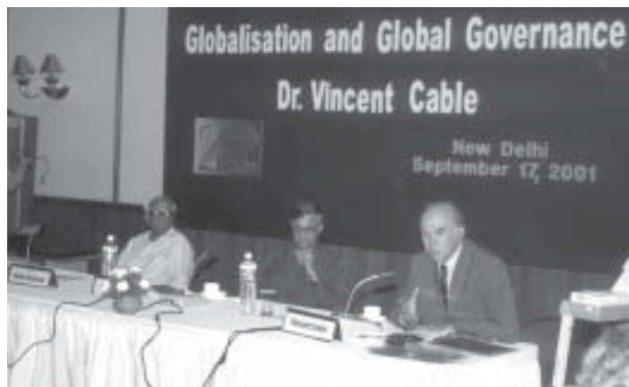
Left to right: Madhu Dandavate, Shankar Acharya and Vincent Cable