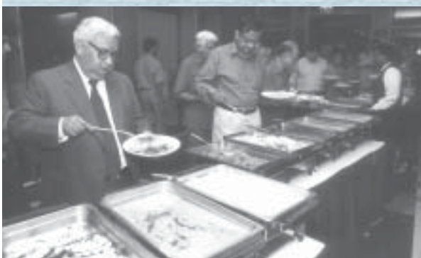
Guests at the dinner party