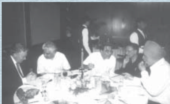
Left to right: Mervyn King, Deputy Governor, Bank of England; Deepak Nayyar, Vice Chancellor, University of Delhi; N K Singh, Member, Planning Commission; Shankar Acharya, Honorary Professor, ICRIER; and Montek Singh Ahluwalia, Director, Independent Evaluation Office, IMF, Washington, D.C.