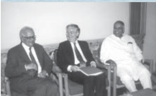
Left to right: Bimal Jalan, Governor, Reserve Bank of India; Mervyn King, Deputy Governor, Bank of England; and Finance Minister Yashwant Sinha